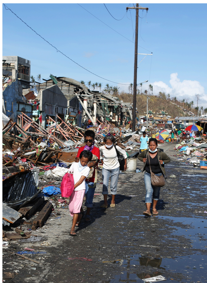
Residents evacuate from their homes after a strong typhoon struck the Philippines, causing widespread flooding and damage. The country remains one of the most vulnerable globally to climate-related disasters.

“With the world, especially developing nations, engulfed by an escalating storm of climate disasters, inaction is no longer an option. It is time for decisive, collective action that transforms challenges into opportunities, restructures our financial systems for real impact, and secures a resilient future for all.”