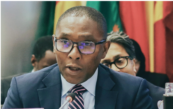
Selwin Hart , Assistant Secretary-General, United Nations

“Finance and planning ministries need to play a central role in the formulation and preparation of these new NDCs, these new national climate plans. They need to be aligned with your development priorities, and it will be critical that you're part of this process. So we at the UN, we're all in. We will continue to support you.”