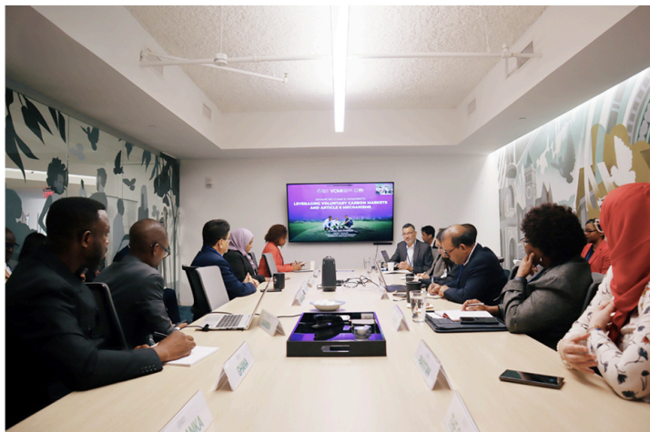
The Voluntary Carbon Market Integrity Initiative (VCMI) and the Climate Vulnerable Forum and its V20 Finance Ministers (CVF-V20) have partnered to leverage carbon markets in support of climate prosperity.

This was emphasized during the second carbon finance workshop series entitled “Advancing Climate Prosperity: Leveraging Voluntary Carbon Markets and Article 6 Mechanisms,” held in collaboration with the Voluntary Carbon Markets Integrity Initiative (VCMI) on 22 April 2025 in the margins of the 2025 Spring Meetings of the International Monetary Fund (IMF) and World Bank Group (WB).