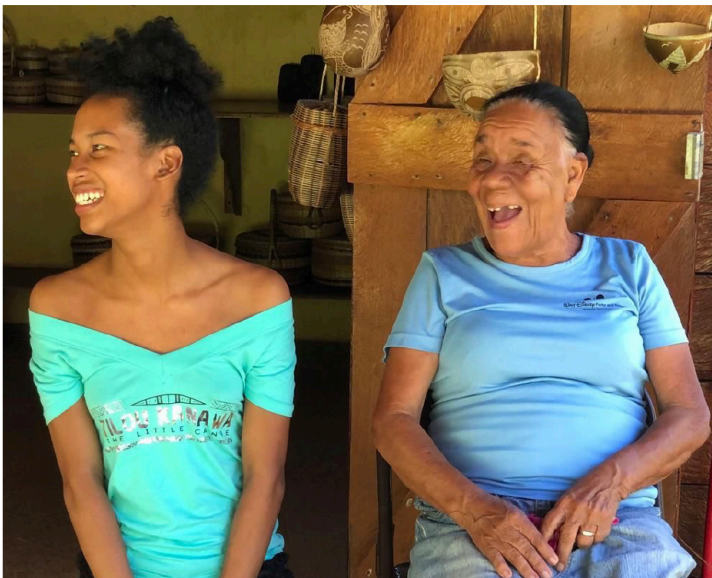
The Kalinago experience offers a blueprint for indigenous survival that transcends geographical boundaries – where traditional knowledge becomes not just a repository of the past but a living framework for navigating uncertain futures.

Whitney Mélinard is a CVF Youth Fellow from the Commonwealth of Dominica. Whitney is an indigenous advocate from the Kalinago Territory in the Commonwealth of Dominica with a background in journalism and a passion for intersectional advocacy, climate justice, and human rights.