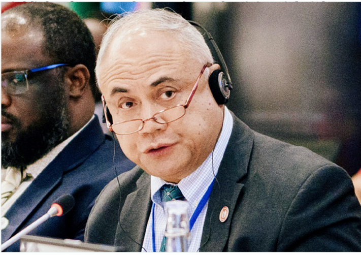
Dr. 'Aisake Valu Eke , Prime Minister and Minister for Finance, Kingdom of Tonga

“Public finance and private investment must be mobilized through clear, predictable policies and supported by planned debt finance and de-risking tools such as concessional loans and guarantee. Access to affordable finance is paramount, and we welcome the finalization of IDA21. We're expecting more resources allocated for vulnerable countries.”