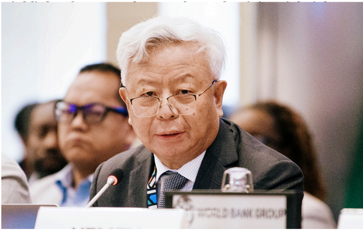
Jin Liqun , President and Chair of the Board of Directors, Asian Infrastructure Investment Bank (AIIB)

“AIIB remains steadfast in its commitment to strengthen the effectiveness and capacity of the international development system in addressing global challenges such as climate change.”