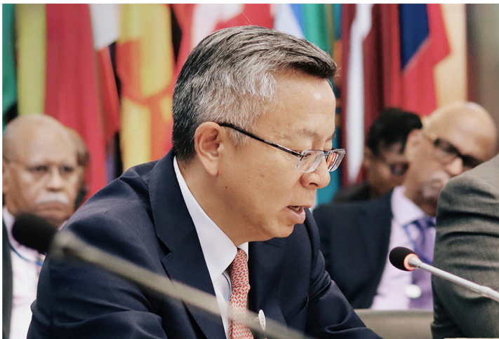
Bo Li , Deputy Managing Director, International Monetary Fund

“Where countries need support, the IMF will be there, especially for vulnerable members such as those who are part of the V20 group. We are committed to staying at the forefront of the emerging challenges, staying agile by adapting our toolkit, advice, policies and procedures, and capacity development.”