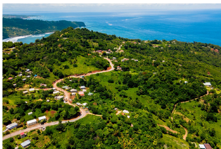
For indigenous communities, climate change is not just an environmental crisis, but a relentless assault on cultural identity.

Amid the escalating turmoil of global climate upheaval, the Kalinago—one of the Caribbean's Indigenous Peoples—stands at the frontline of survival with their ancestral lands and cultural heritage edged toward oblivion. Their way of life—woven from sacred traditions, intricate craftsmanship, and rich oral histories—springs from a profound connection to the land, where every river tells a story, every stone holds a memory, and every plant offers sustenance or healing.