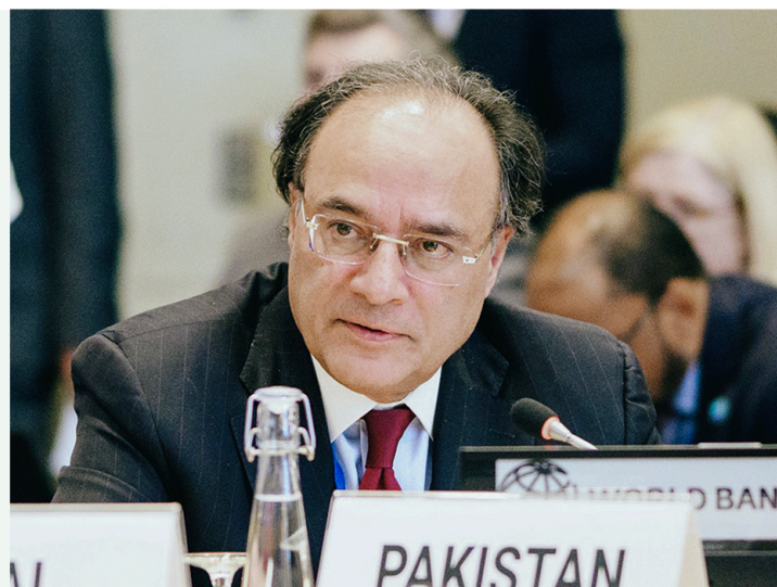
Seedy K. M. Keita , Minister Finance and Economic Affairs, Republic of The Gambia

“The challenge for us as much as it's financing, it's also capacity building in terms of coming up with investible, bankable projects around reconstruction, rehabilitation, recovery, and everything associated with that, because that, I think, is ultimately what's going to make it sustainable in terms of having those projects which can be structured, which can be monitored, and can be reported at international standards.”