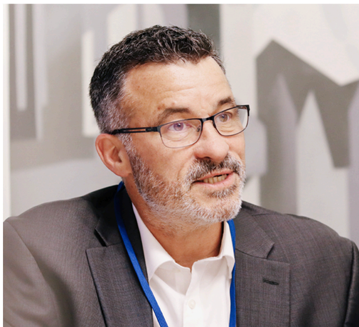
VCMI outlined the provisional updates on Article 6 of the Paris Agreement, as finalized during COP29 in Baku, Azerbaijan.

Recognizing the significant opportunities the carbon market offers for enhancing member countries' investment strategies—particularly through Climate Prosperity Plans—the CVF-V20 remains committed to tracking the development of the international market and its standards.