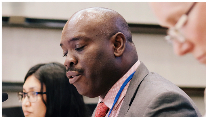
Ryan Straughn , Minister in the Ministry of Finance and Economic Affairs Barbados, CVF-V20 Presidency

“We have lost 20% of our potential GDP growth due to climate change, rising capital costs three times higher than in G7 countries, youth unemployment soaring to 20 percent, and mounting security threats. This is the cause of global climate inaction for the most vulnerable.”