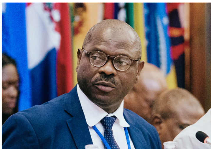
Olavo Correia , Vice Prime Minister and Minister of Finance, Republic of Cabo Verde

“We must be clear and dispel the misguided notion that Africa and other climate-vulnerable regions do not care about climate change and would rather just focus on development. These are not trade-offs. We must be clear that, in the immediate urgency of saving lives, these impacts will worsen now for decades and even in the most optimistic emission scenarios.”