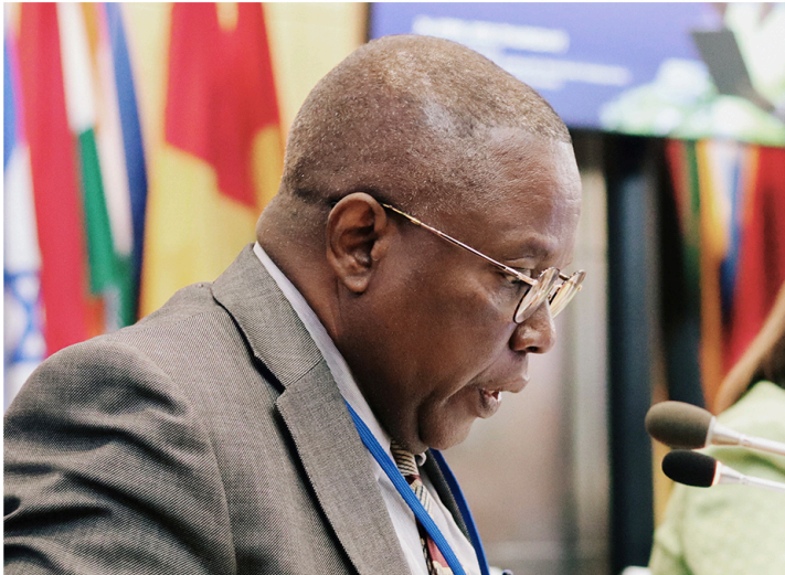
Nii Moi Thompson , Chairman, National Development Planning Commission (NDPC), Ghana

“V20 countries, which represent 21% of the global population but hold only 6.7% of the voting power at the IMF, continue to face systematic – systemic exclusion from decision making and equitable access to global capital. We must work together to rebalance the system so it channels capital towards resilience and prosperity, not away from it.”